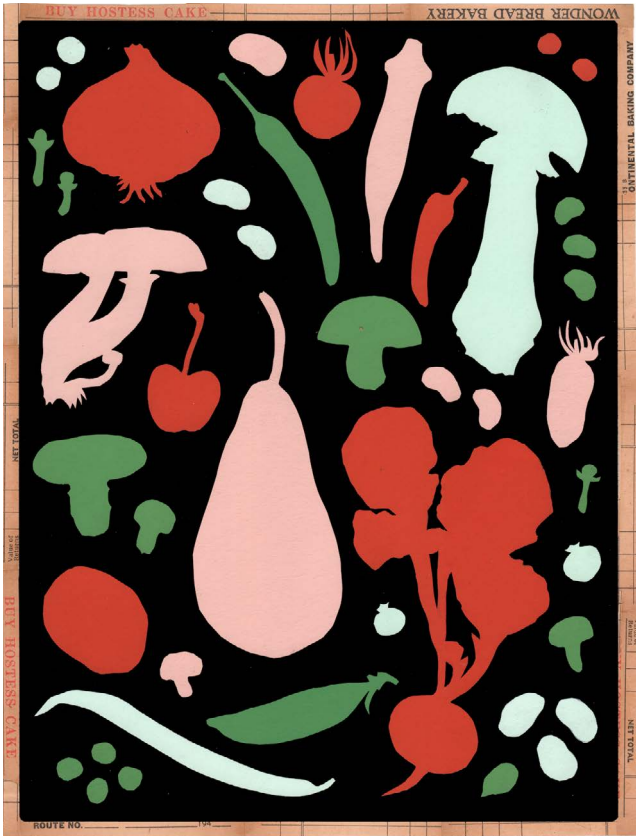
Art by Shannon Axelson SarahLandwehr (top to bottom)