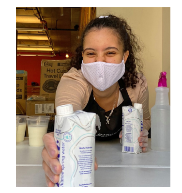
A volunteer offers water.

Volunteers gave out water, ice, reusable bottles, misters, and hygiene care