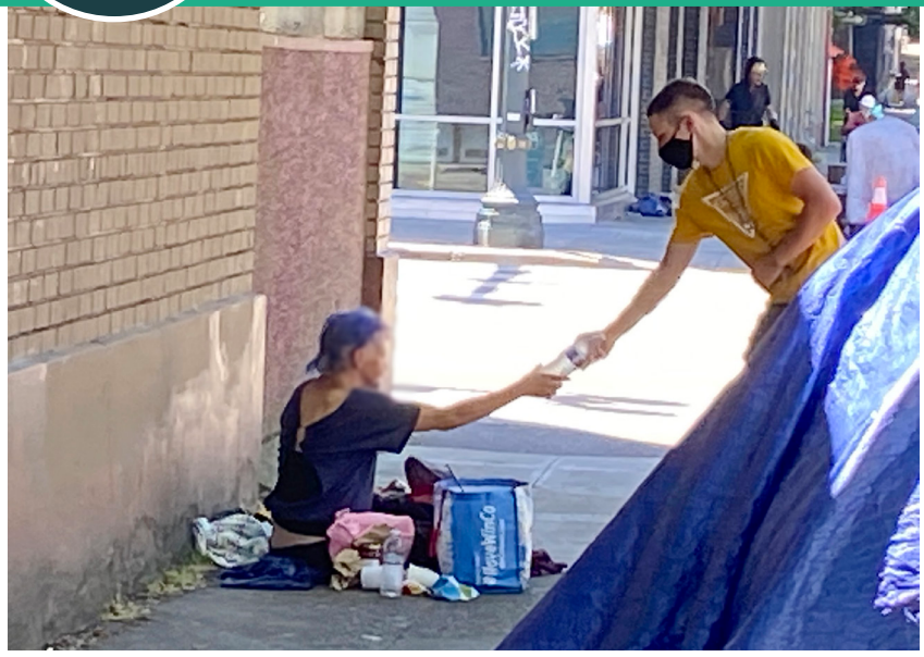
Staff brought cold water to people during the heat waves.